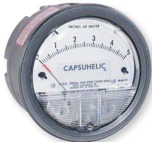
Capsuhelic® pressure gage has a large, easy-to-read 4" (102 mm) dial.