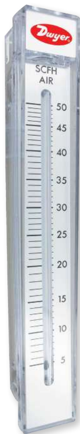
Model RMC 10" scale, 15-3/8" high