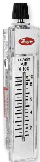
Model RMA-TMV 2" scale, 4-13/16" high