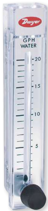
Model RMB-SSV 5" scale, 8-3/4" high